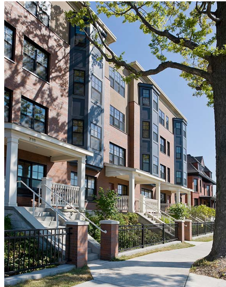
Walk-out entrances for ground floor apartments and a brick facade helped match the historic neighborhood.

"As developers and owners of supportive and affordable housing, Aeon is interested in breaking boundaries with their work," said Prinds. "They want to show that what is often seen by the mass market as marginal housing can be as good as any other type of housing."