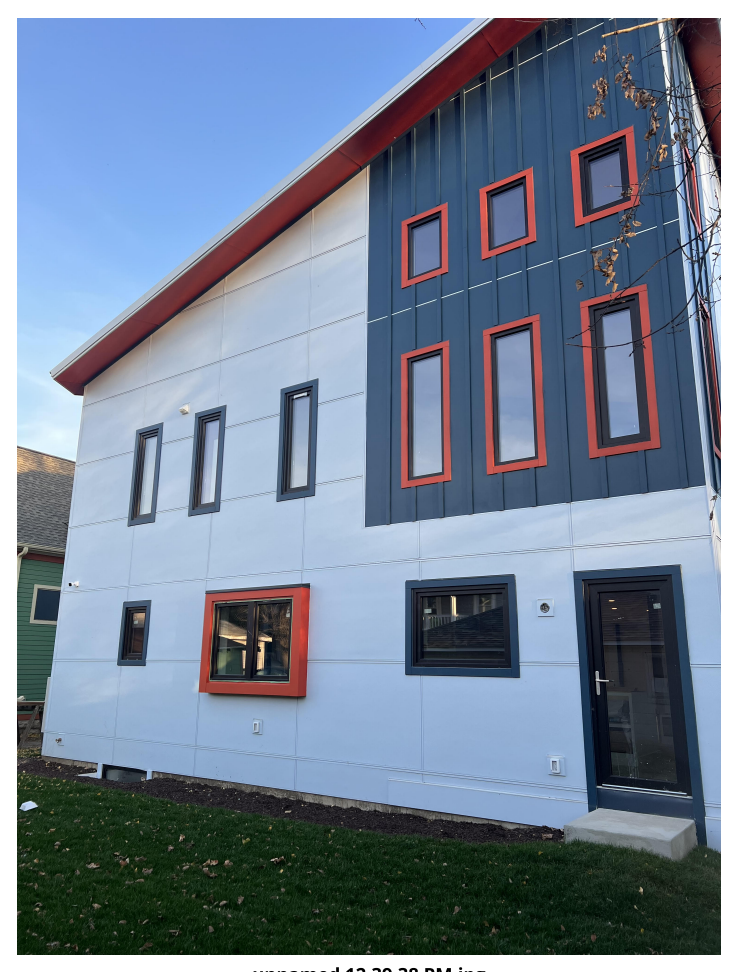
unnamed 12.39.38 PM.jpg