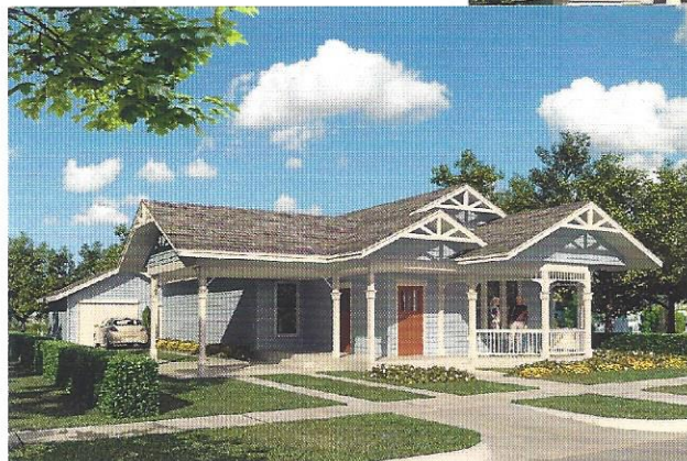
Plan C 1376 sqft