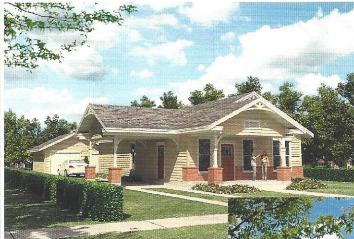
Plan A 1404 sqft

Beautiful, energy efficient homes for sale in southeast Fort Worth with up to $14,999 in down payment assistance available!